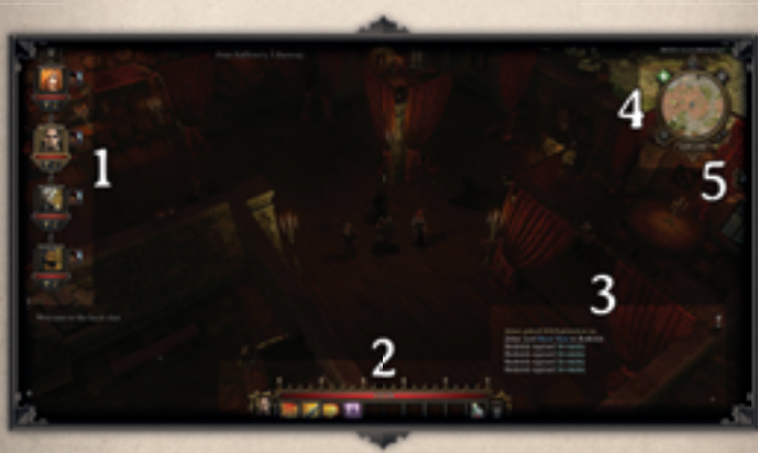
1. Character list 2. Status Bar 3. Game log 4. Minimap 5. Rift Travel

Below each portrait are two buttons: Skills and Inventory . Single-clicking these brings up that character's Skills panel or Inventory panel respectively. Multiple Inventory panels can be opened simultaneously in order to compare characters and facilitate trade between them.